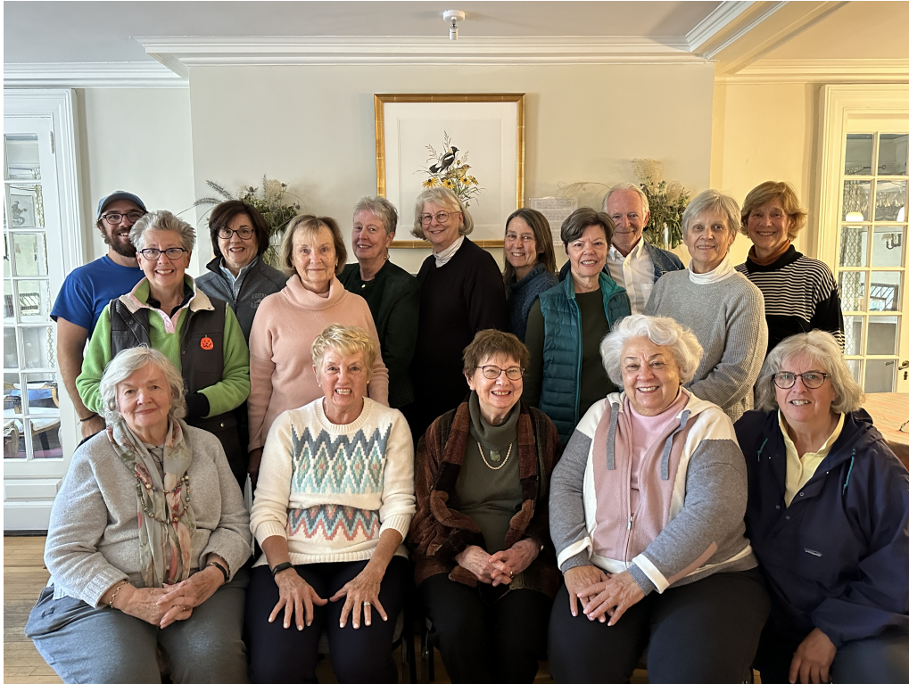
Our very hospitable host and hostess at the Roger Tory Peterson Estuary Center accommodated this photo-op in indoor comfort.